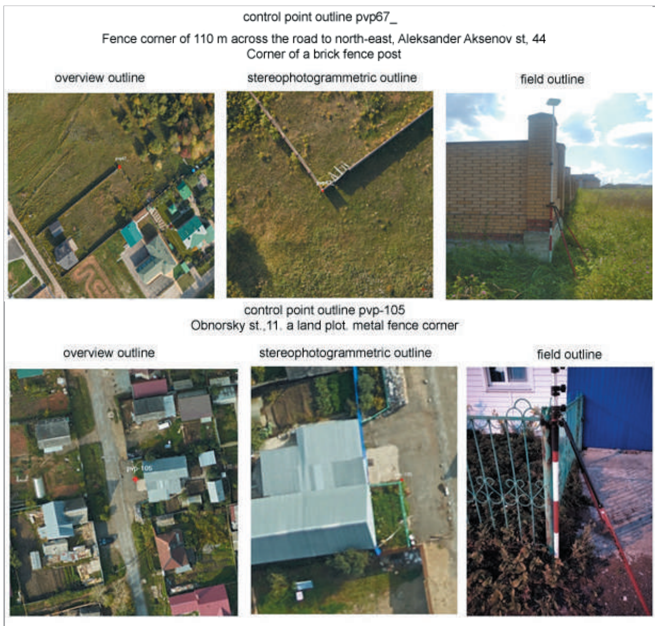
Fig. 2. Examples of outline control points

The coordinates of all control points were determined by the stereophotogrammetric method. As suggested in the research, the definitions were carried out in two ways using PHOTOMOD6. Figure 2 shows examples of control points of various types (based on the materials of the work performed), so these are landmarks.